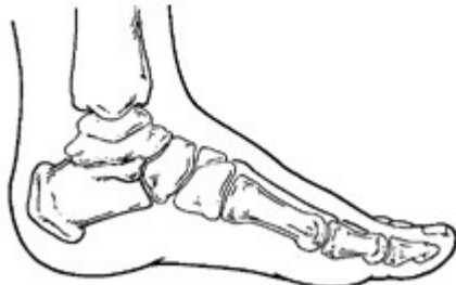
Normal pediatric foot

Flatfoot can be apparent at birth or it may not show up until years later, depending on the type of flatfoot. Some forms of flatfoot occur in one foot only, while others may affect both feet.